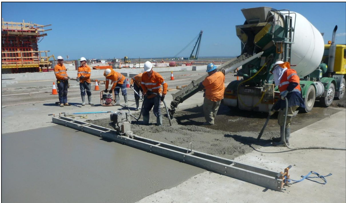
Paving works for the ASC rail beams