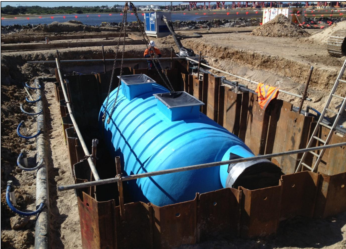
Installation of one of the Terminal 3 Stormwater Quality Improvement Devices - SQIDs