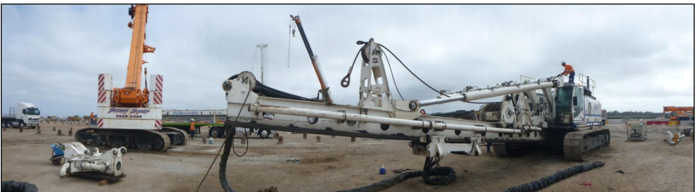
One of the piling rigs used to construct the ASC rail beams