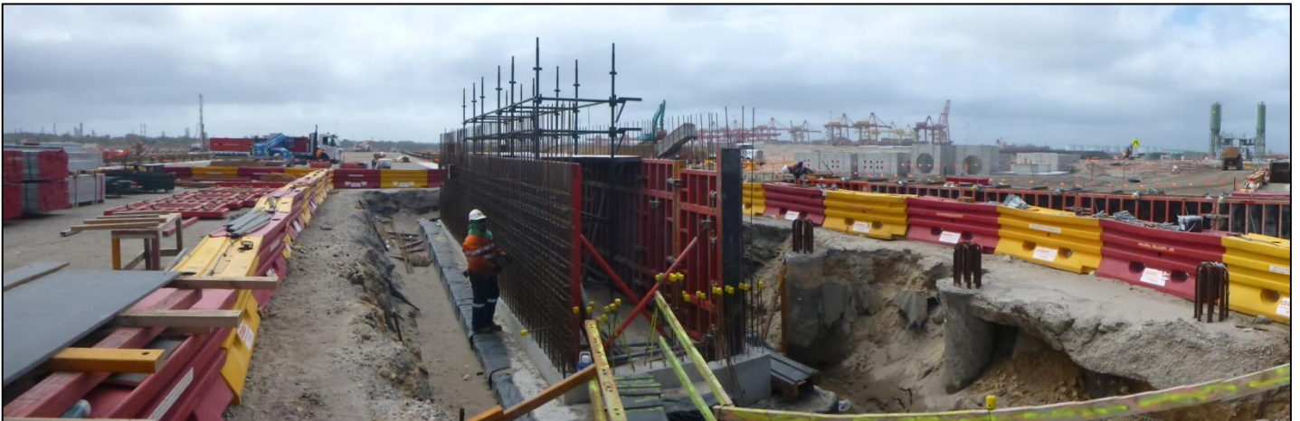
Construction of one of the electrical substations on the Terminal 3 site